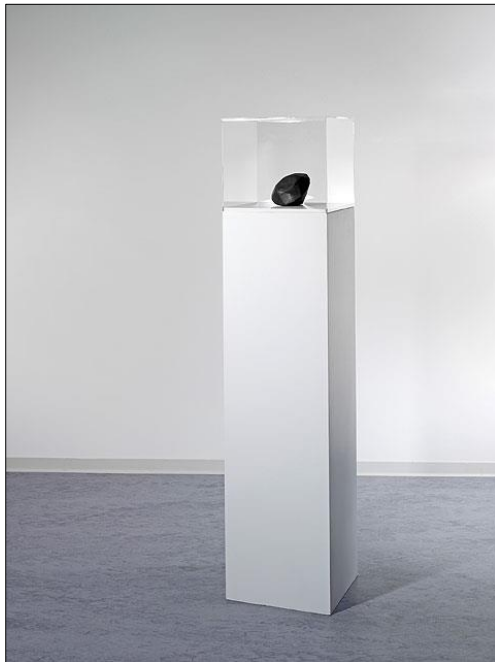
Figure 9 Alicja Kwade, Lucy , 2006

The small visual cues discernible in Lucy and Curb Jewels ; namely the multi-facet cut, the polishing of stones and the raised pedestal allude to gemstones of considerable monetary exchange value and we begin to formulate an estimate of their material worth before we even examine the stones that lie before our eyes. These visible clues which act like value signals in an empirical system; where “cultural assumptions about worth” are judged by the physical framing and visual display, are deeply