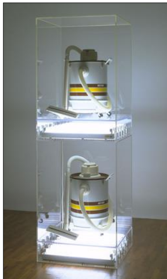
Figure 2 Jeff Koons, New Shelton, Wet/Drys 10 Gallon, Doubledecker , 1981 from The New Series

Yet, New Shelton Wet/Dry Double-decker of 1981 (See Fig. 2) from his The New series is part of MOMA’s permanent collection display; an unlikely place to occupy had it been a promiscuous assemblage of mass produced objects with no real use. His unorthodox sculpture of two vacuum cleaners on top of each other and their encasement in transparent Plexiglas box; which appropriates Marcel Duchamp’s readymades robbed these everyday objects off their utilitarian function and displaced them from their natural setting; namely the house. Like Duchamp’s readymade objects, the vacuum “initiates a critical act that compels the reader or viewer to renounce critical judgement and to consider instead how different contexts affect meaning, to understand that all meaning is socially constructed”. 2