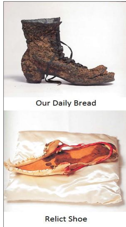
Figure 6 Birgit Jürgenssen, Schuhwerk Series, 1976

Further, the title of these shoes embodies the very notion of this continued practice. As Solomon-Godeau notes, "It reminds us that patriarchy is not something "done" to women, but rather, a complex and highly articulated sex/gender system that women themselves assimilate, internalize and thereby perpetuate". 23 Women's endless pursuit of eternal youth, the publicised glamour and ability to distinguish oneself is embodied in this commodity object; the desirable fashion shoes.