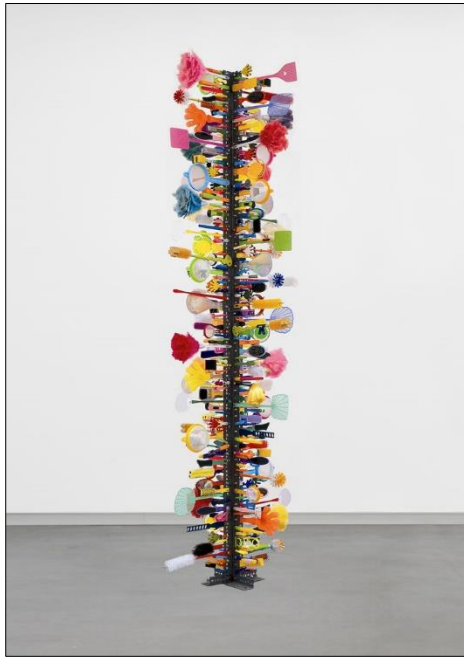
Figure 7 David Batchelor, Parapillar 7 , 2006

grotesque, the poetically allusive, the horrific”, and above all the transformative and malleable properties of common materials. 25