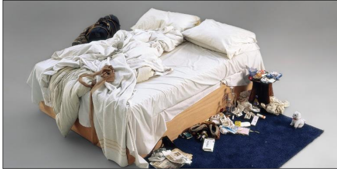
Figure 5 Tracey Emin, My Bed , 1998

Perhaps, Tracey Emin's infamous bed is one of the best 'lowly work' art pieces that exemplify the