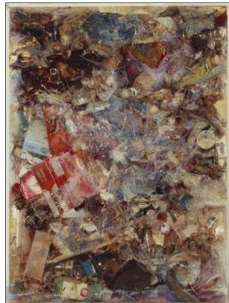
Figure 4 ARMAN, Ecology #2 , 1970 from his Poubelle Free Standing series

condoms, dirty tissues, menstrual-blood soiled knickers and two chained suitcases (see Fig. 4). It demonstrates how 'rubbish' can acquire a monetary exchange value through its framing. This banal setting and rather revolting selection of mass produced objects was auctioned by Christie's in 2014 and sold for GBP 2,546,500. 12 As Stallabrass notes, "In recombining and storing what has gone out of use, art may also serve a similar purpose to 'junk' DNA, which is believed to hold obsolete sequences in reserve in case they should be needed again". 13 Whilst Stallabrass and many post-modernism critics scorn the astronomical exchange value awarded to celebrity art objects in the free market, they do not denigrate their artistic significance. Indeed, the art 'guardians' recognise the artistic value of Emin's bed to the degree that it is re-displayed today at the Tate Gallery after 15 years of absence. Emin's confessional art which takes the form of creative documentation interrogates our structured formalism around the archiving process. By pushing back against the conventional notions of the archive where they became a "site of lost origins and [dispossessed memory]" 14 , she reacquaints us with their original and true purpose; that of regenerating our lost emotions,