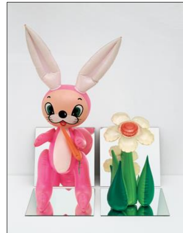
Figure 1 Jeff Koons, Inflatable Flower and Bunny (Tall White, Pink Bunny) , 1979 from Inflatables Series

Jeff Koons maybe regarded as one of the most controversial artists today. Not only did he use readymade mass produced objects in many of his art series like Popeye , Inflatables and The New among others (see Fig. 1), but he also embraced the all-engulfing and mighty consumerist culture and played by the rules of capitalist economies much to the dismay of contemporary art critics, “artists like Jeff Koons ... appeared to delight, nihilistically, in the commodity fetish and the media celebrity as the historical replacements of the auratic art work and the inspired artist. In effect he acted out what Walter Benjamin had predicted long ago for capitalist society: the cultural need to compensate for the lost aura of the art and artist with “the phony spell” of the commodity and the star”. 1