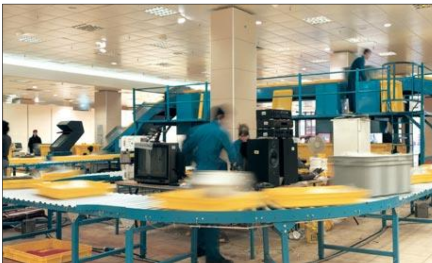
Figure 10 Michael Landy, Break Down , 2001

Several artists recognise this inevitable commercial end to their creations. They sought various ways to ‘de-create’ art and render it impossible to sustain a monetary exchange value for. Michael Landy’s 2001 Break Down art project is perhaps the most celebrated and successful art piece which