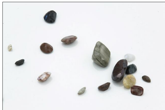
Figure 8 Alicja Kwade, Curb Jewels , 2008

Polish artist Alicja Kwade successfully illustrates the notion of a learnt perception of value. In Curb Jewels of 2008, Kwade collected stones she found in the streets of Berlin and had them cut, carved and polished in the classical facet style adopted by the fine-jewellery industry. She is not attempting to fool the viewer, but rather to question and reflect on the “conventions that determine the value of